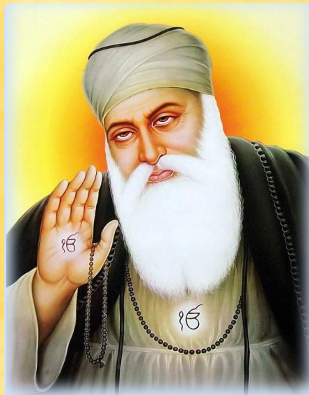
Guru Nanak Jayanti 5 th November, 2025